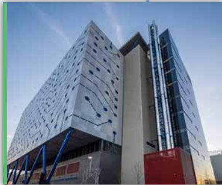
Coriander Avenue, London, E14 2AA

Telehouse offers LINX PoP's in every building and the campus is easily the busiest LINX site in London. AWS Direct Connect is also now available.