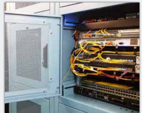
Amito Quarter Rack front view