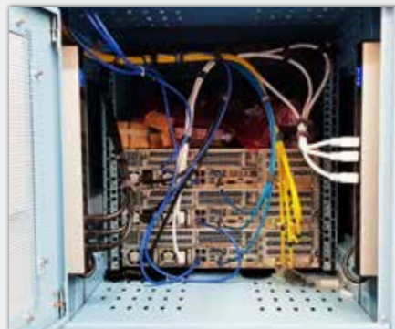
Amito Quarter Rack rear view showing dual power bars