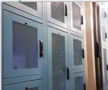
Amito part racks in Telehouse